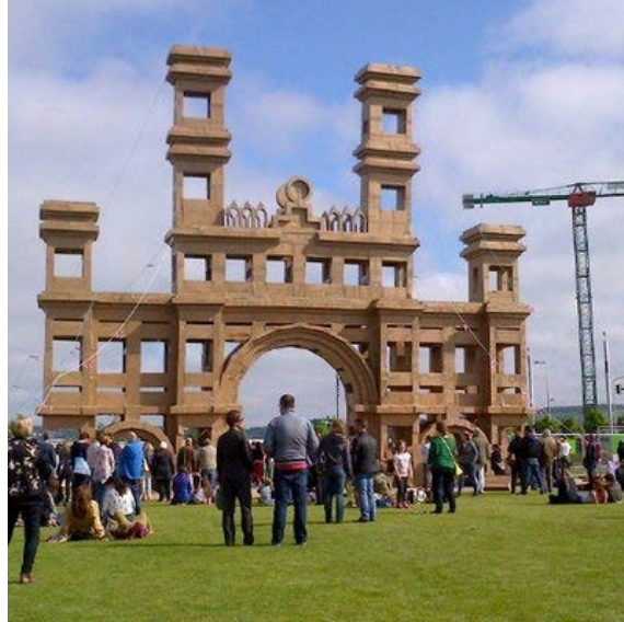
IHBC Scotland Branch