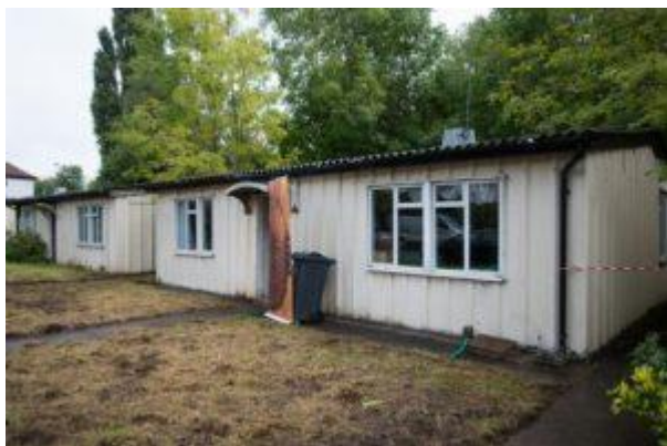
Wake Green Road Prefabs

The Grade II listed Phoenix prefab bungalows in Wake Green Road were designed and manufactured by John Laing, McAlpine and Henry Boot, as part of a consignment of 2,428 prefabs supplied to the Ministry of Works under the Temporary Housing Programme. These temporary homes were only expected to be in use for ten years but 70 years on they are still in use. There are no other known surviving Phoenix prefabs still lived in which makes these extra special.